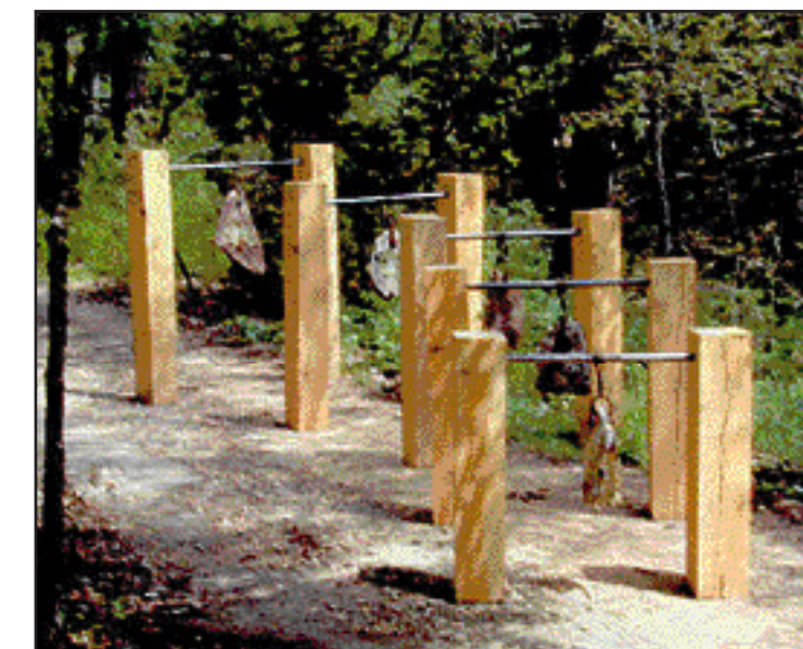
THE INSTALLATION, "YOKES ON THE TRAIL OF TEARS" BY PAT MUSICK, SHOWN HERE IN ITS NATURAL STATE, WILL BE RECREATED IN AN EXHIBIT FOR BAUM GALLERY.

■ WHAT: THE BAUM GALLERY ■ WHERE: UNIVERSITY OF CENTRAL ARKANSAS CAMPUS ■ WHEN: 1 TO 5 P.M. SUNDAY; 10 A.M. TO 5 P.M. MONDAY, WEDNESDAY, THURSDAY; 10 A.M. TO 8 P.M. TUESDAY